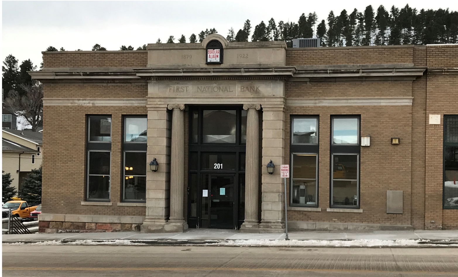
Main Office – Occupancy beginning January 2019